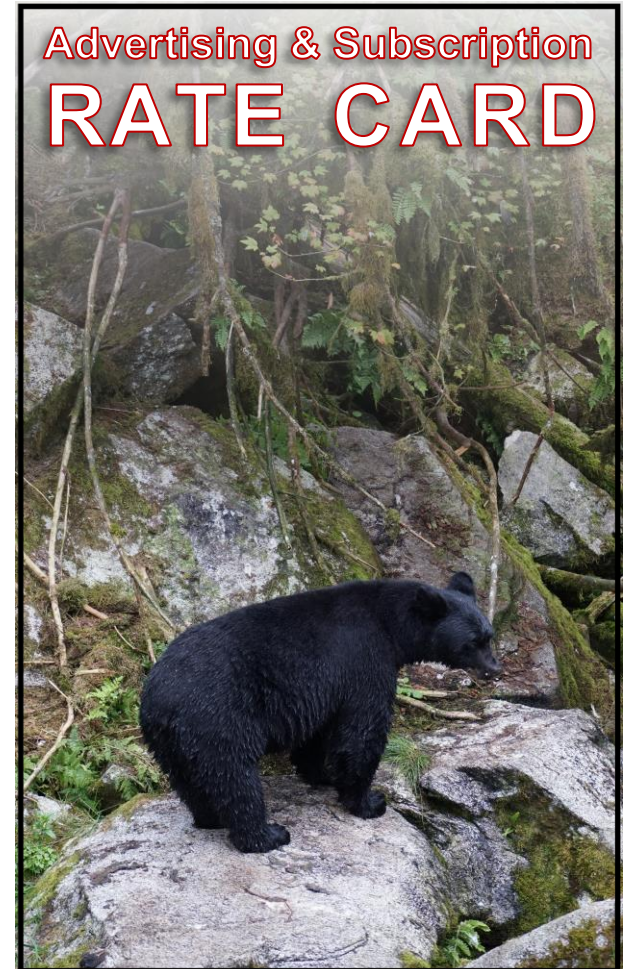
Bears visit Anan Creek to feast on salmon every summer.

----- The Sentinel reserves the right to charge an additional 20% fee for all advertising requiring heavy composition. Earlier deadlines of one day required.